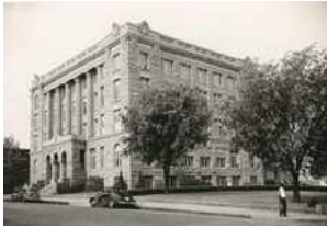
LAMAR COUNTY, TEXAS